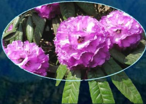
STATE TREE RHODODENDRON Rhododendron niveum