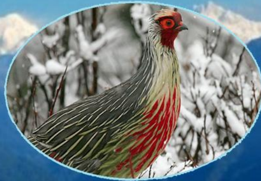
STATE BIRD BLOOD PHEASANT Ithaginis cruentus