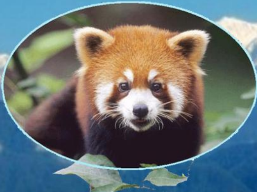
STATE ANIMAL RED PANDA Ailurus fulgens