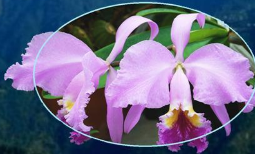
STATE FLOWER ORCHID Dendrobium nobile